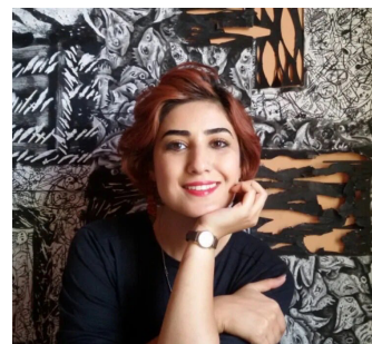
Atena Farghadani (Iran)