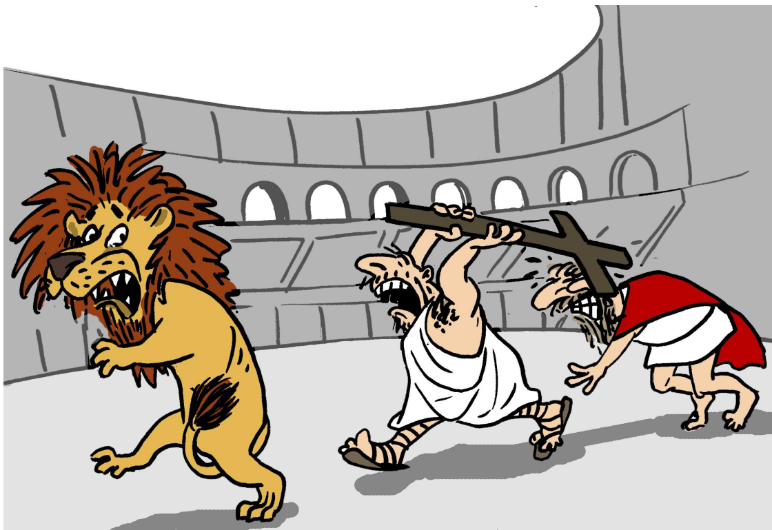
This cartoon entitled "Christian Persecution" expresses the cartoonist's vision of the condemnations he is the target of.