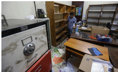
View of the offices of the Confidencial newspaper, photo published in The Guardian, Alfredo Zuniga/AP, December 15, 2018

On December 14 and 15, 2018, the police violently stormed the offices of the newspaper Confidencial.com.ni to seize, without a legal warrant, computers and editorial documents and block access to journalists involved in denouncing corruption and abuses of power by President Ortega.